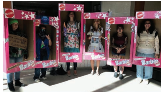
Group Costume Winners Barbie Rejects, Pinnaco