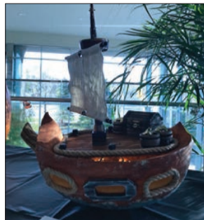
8000 Tower – "Judges Booty", Sydney Banks, Pinnaco